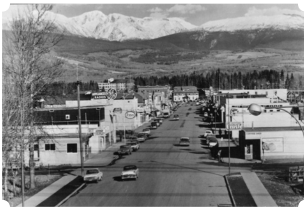
The present museum building at the foot of Main Street, Smithers, 1950.