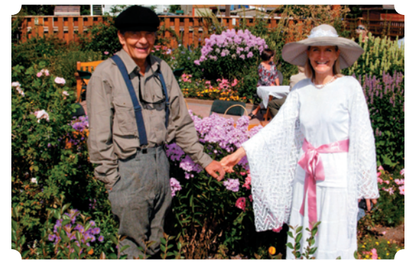
The Old Church Gardens, Summer 2009